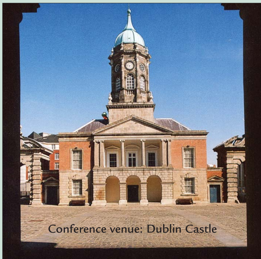
Conference venue: Dublin Castle

The first issue of Finance Dublin appeared in January 1996, to enable the provision of more specialised and detailed articles on the evolution of the IFSC formerly pioneered in Finance , its 'sister' publication (www.finance-magazine.com) which, in 1987, published the first printed material outlining the financial incentives developed by the Irish Government in conjunction with the EU for the development of the Dublin IFSC. More information on Finance Dublin is available on our website: www.financedublin.com